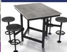
Flexible Mobile Furniture & Storage!