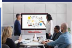
Multimedia & Presentation Tools!

Curriculum and Projects for your equipment!