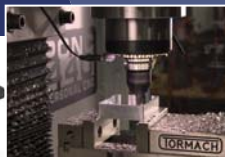
CNC Mills & Routers!