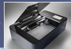
Laser & Vinyl Cutters!